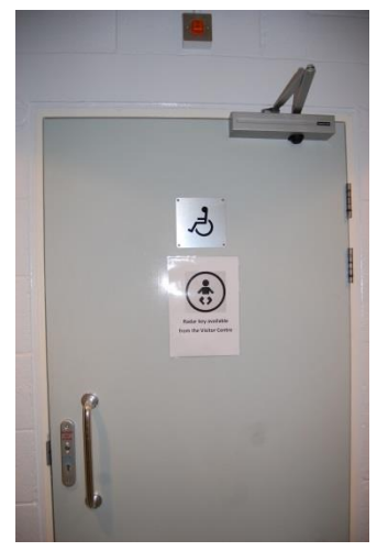
Accessible toilet and flashing light for alarm